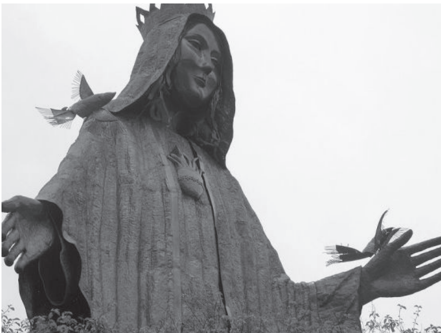
Mary, Queen of Peace, Our Lady of EDSA