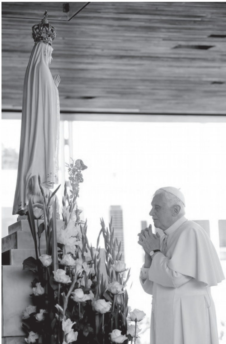
Visiting Fatima in 13 May 2010, Pope Benedict XVI said: “One deceives himself who thinks that the prophetic mission of Fatima is concluded.”