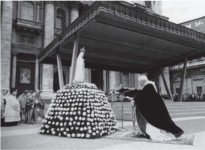
Pope John Paul II consecrates the world to the Immaculate Heart on the Feast of the Annunciation during the Great Marian Year 1984.