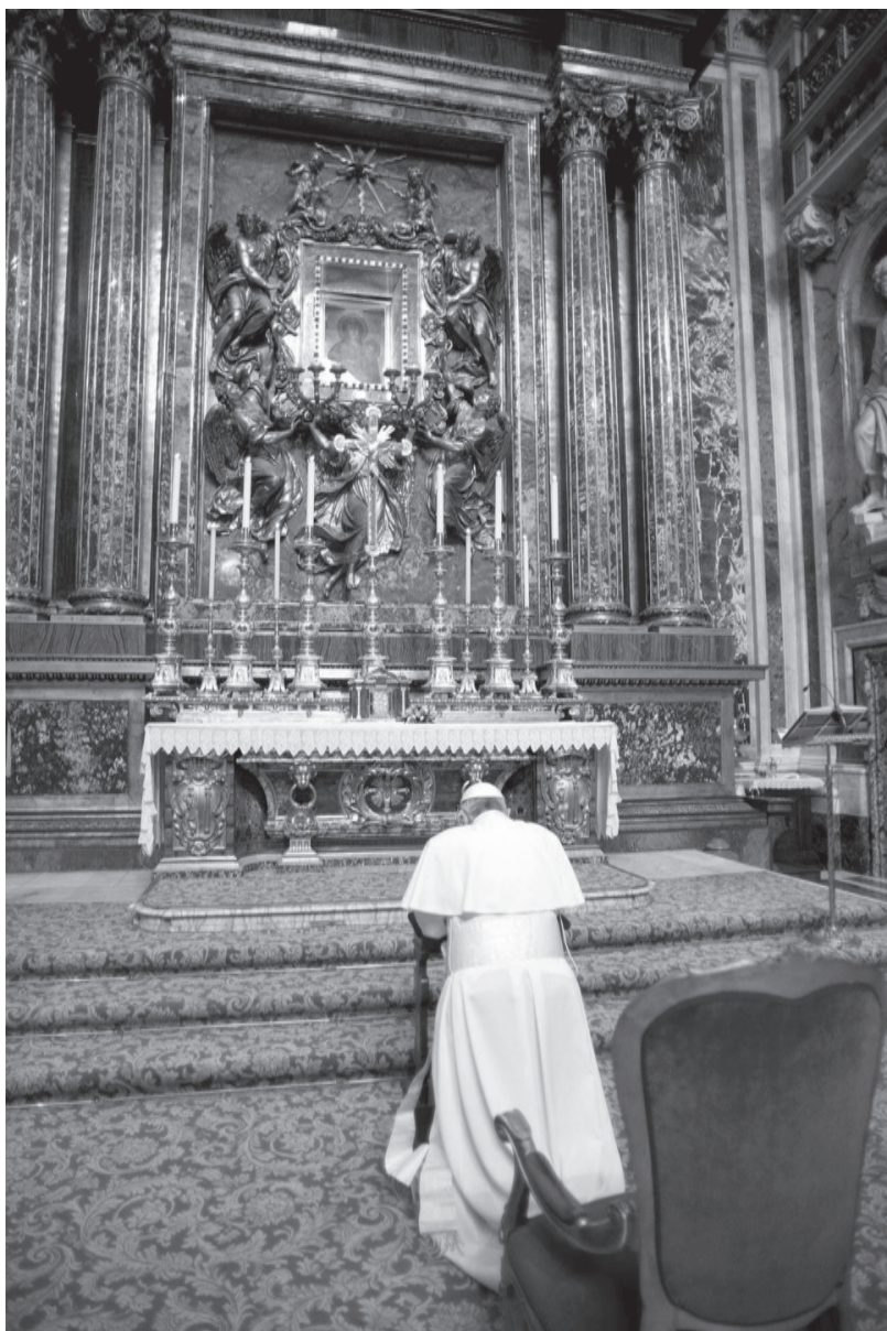
Within twenty-four hours after his election, Pope Francis payed homage to Our Lady and prayed for this period in the life of the Church.